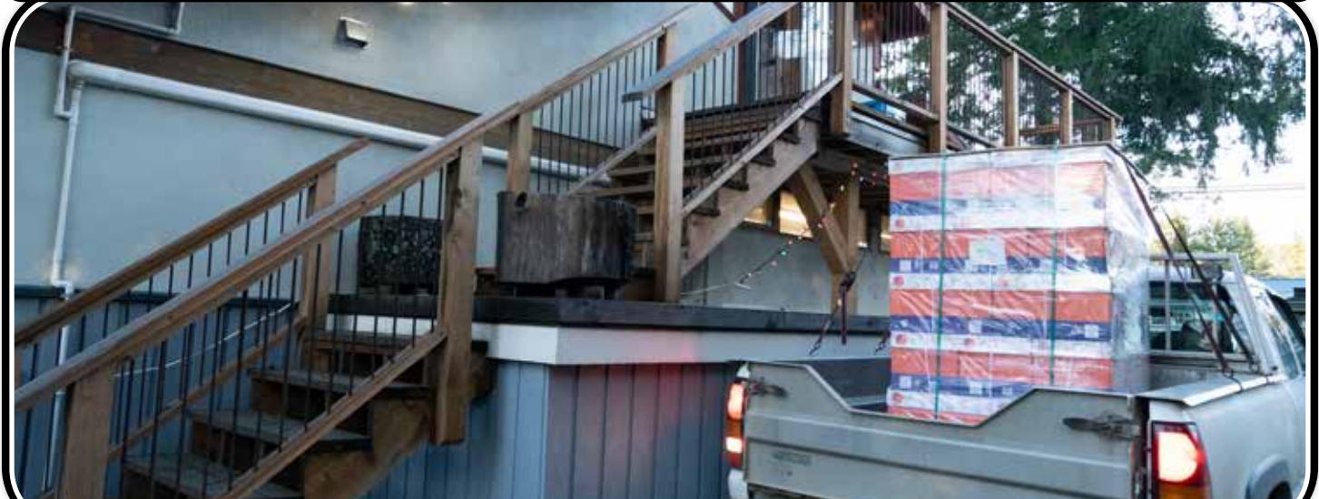
“I was told that the privileged and the people form two nations.” • Benjamin Disraeli