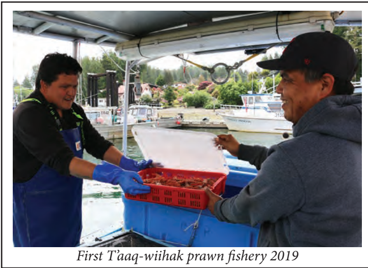
First T'aaq-wiihak prawn fishery 2019

...continued from P.7 “The Court of Appeal clearly stated that the Justice at the BC Supreme Court could not impose new limits on this right and that the commercial right to a fishery was a priority to other fisheries,” she added.