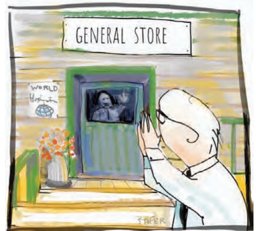
He offered praise and thanks