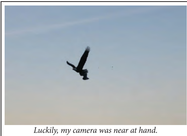
Luckily, my camera was near at hand.

The East Road incident occurred one evening last week as the gulls enjoyed a pleasant apero of herring roe. From out of nowhere we witnessed an eagle attack and kill a seagull. Then the eagle dragged the gull onto the rocks and began eviscerating the bird. The eagle then took off into the skies carrying the seagull above the treeline and presumably back to its nest. I was shocked by the seeming violence and my estimation of the eagle was brought into question.