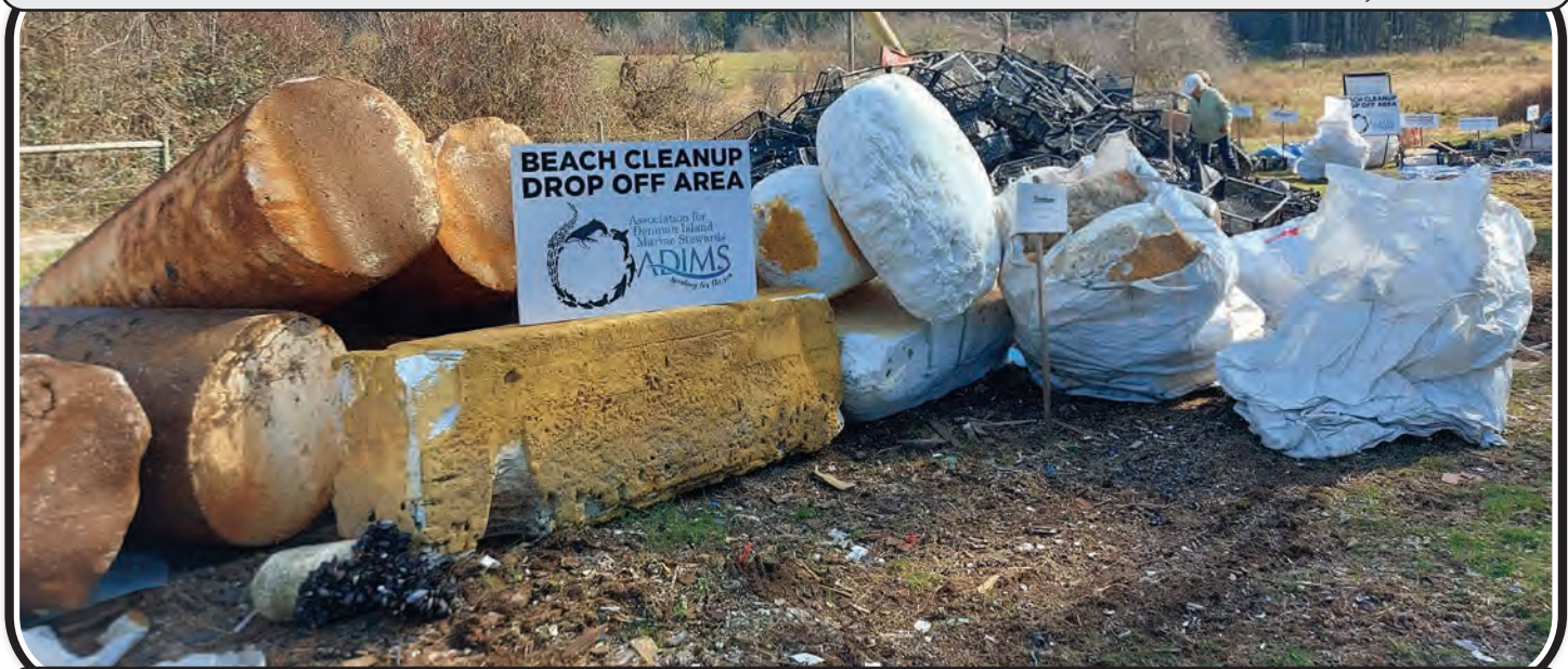
“The Earth is what we all have in common.” • Wendell Berry