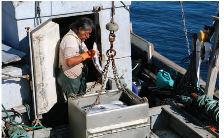
T'aaq-wiihak Fraser sockeye landings 2018