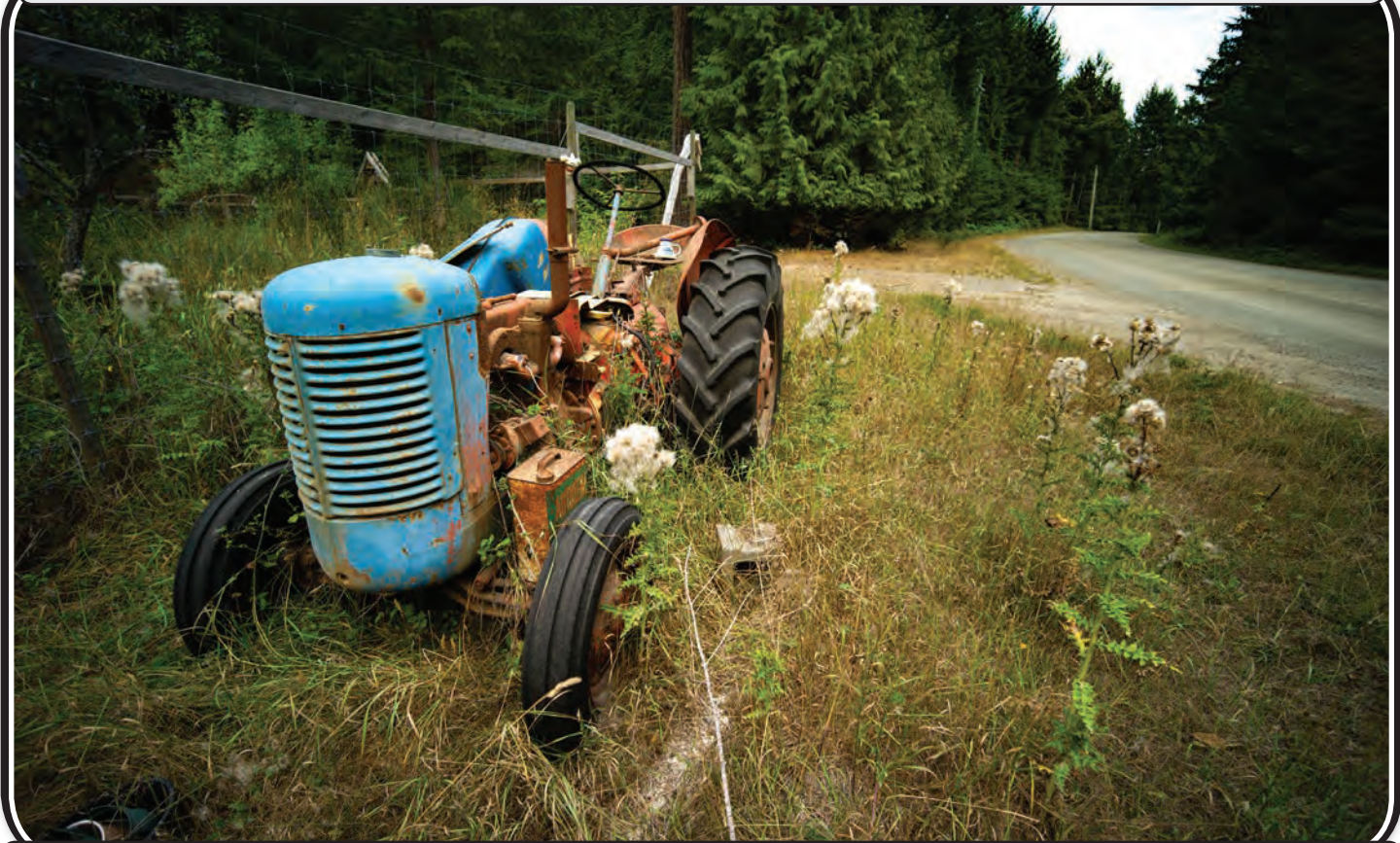
“I make love-like farm equipment - not to farm equipment. There is a difference, though my cousin can't tell it.” • Dark Jar Tin. Zoo, Love Quotes for the Ages