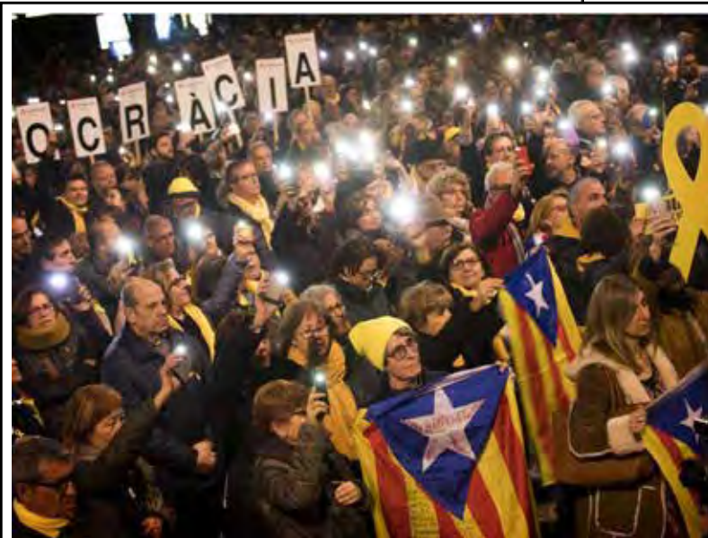
Pro independence demonstrators gather during a protest in Catalonia square in Barcelona, Spain, Tuesday, Feb. 12, 2019. A sensitive trial against a dozen Catalan separatist politicians and activists got underway Tuesday in Spain's Supreme Court amid protests by pro-independence supporters and a highly volatile political environment. Banner in Catalan reads "freedom politics imprisoned".

The new Spanish government that emerges from the forthcoming snap election, whatever it is (nobody knows), won't be able to solve the problem either. The most it can do, if it's sensible, is to commute any prison sentences imposed on the 'Catalan Twelve' and deny them martyrdom.