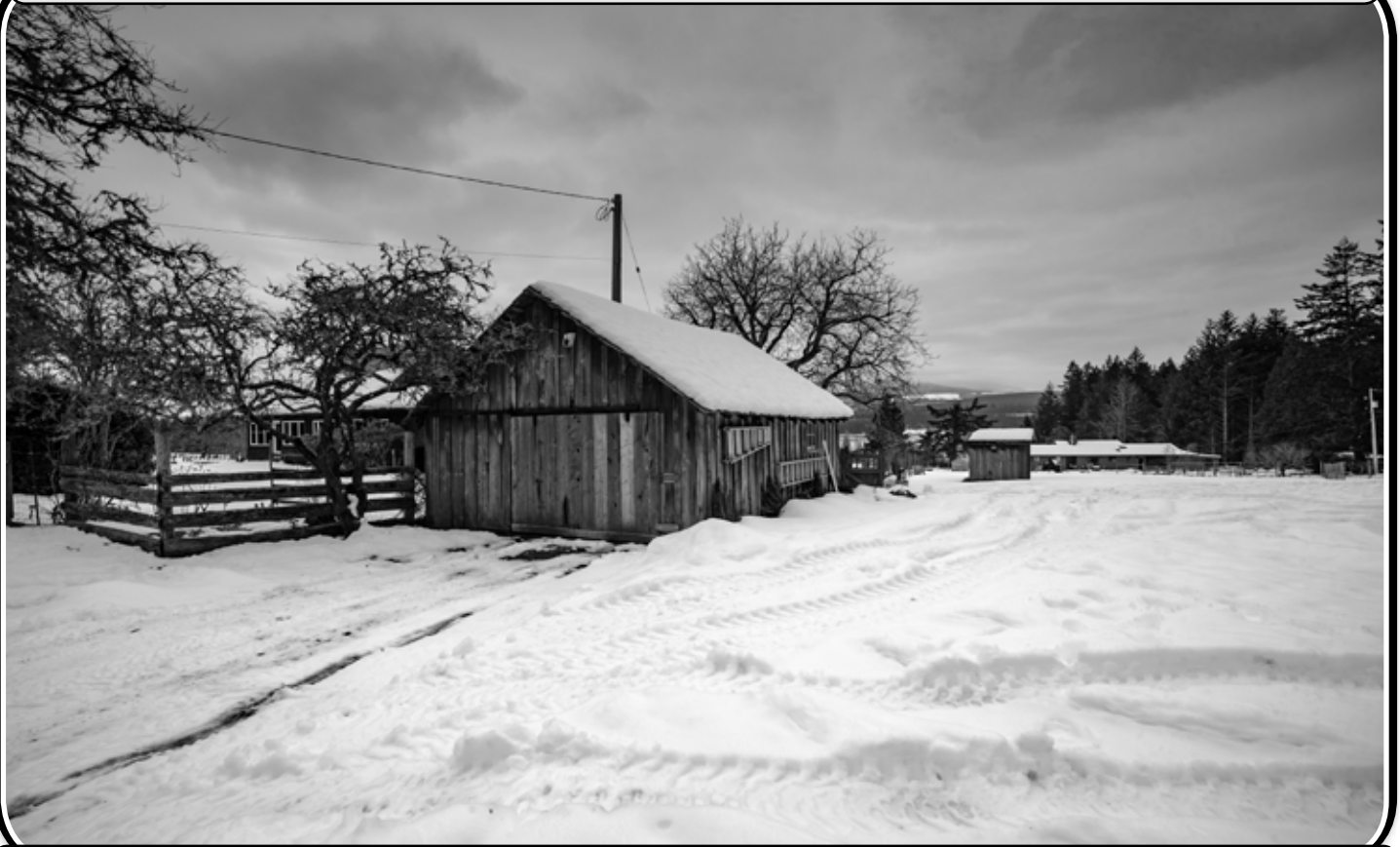
“No Winter lasts forever; no Spring skips its turn.” • Hal Borland