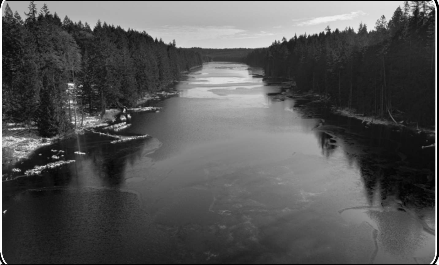
"The brain is wider than the sky" • Emily Dickinson