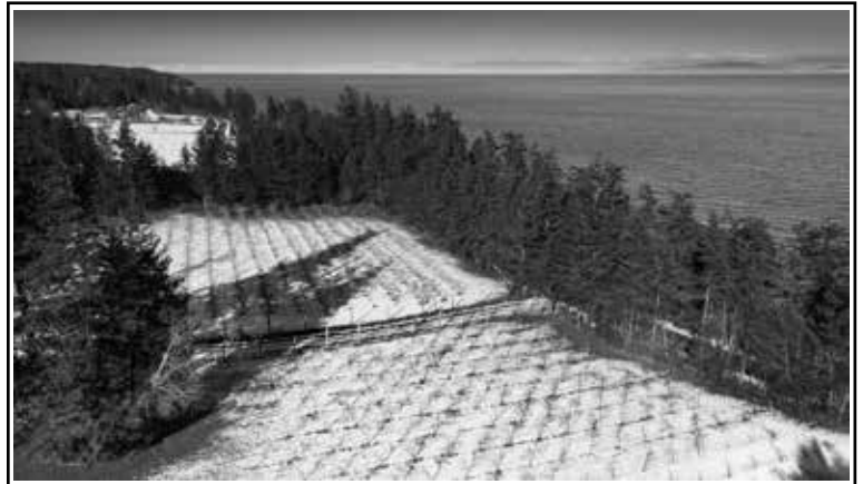
East Cider Orchard, DI

From the Archives - the cover from 25 years ago the February 17th, 1994 issue of the Island Grapevine